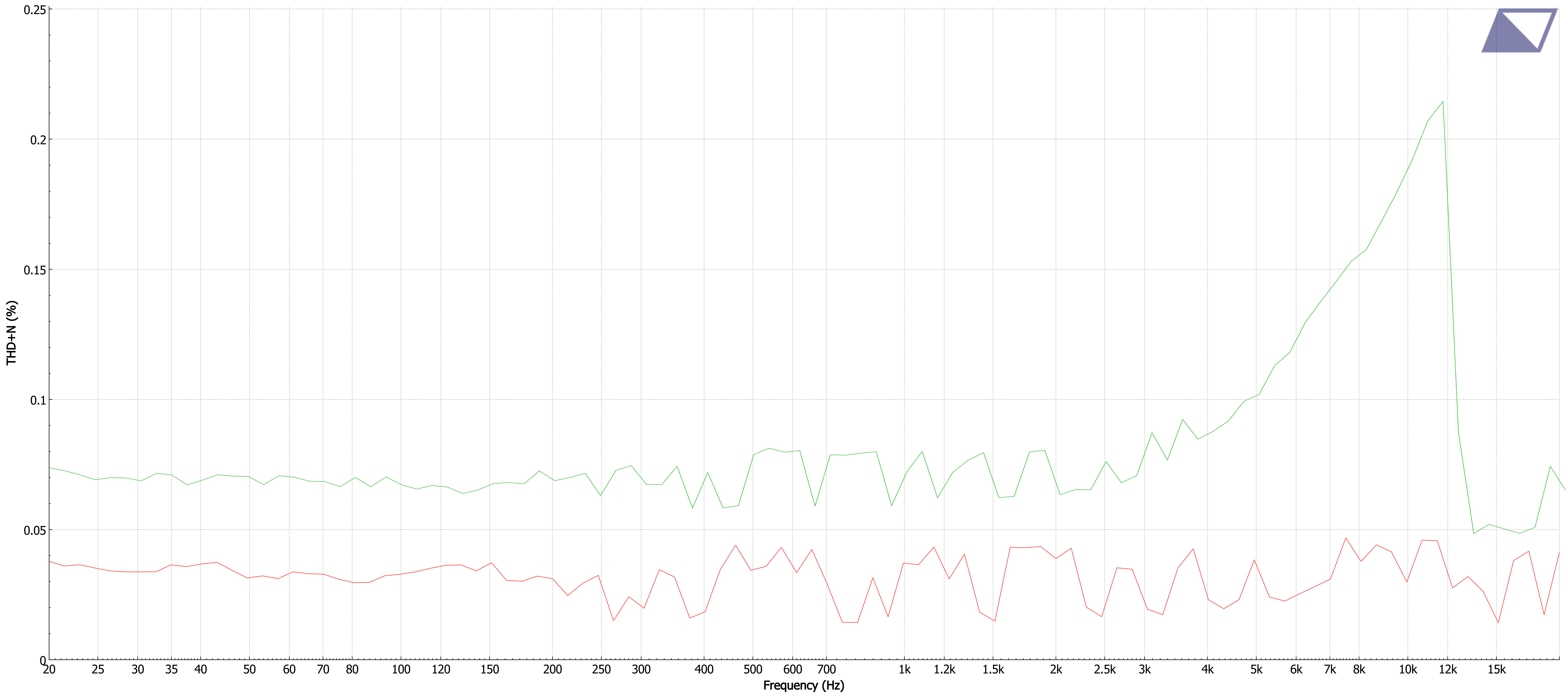
— THD+N (1.5A) - IN (150mV) 20Hz to 20KHZ - OUT (1W) - Analog Unbalanced — THD+N (150mA) - IN (150mV) 20Hz to 20KHZ - OUT (1W) - Analog Unbalanced